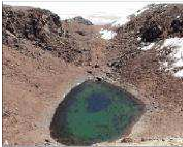
Figure 2. Licancabur Summit Lake photographed during the 2002 expedition from the crater rim, 22°50'S, 67°53'W, 5916m.