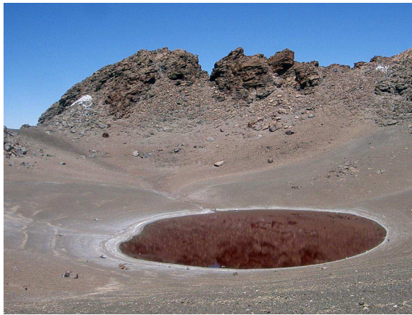
Figure 1. Laguna Aguas Calientes, 23.22°S, 67.41°W, 5870m, Northern Chile.

We present data and results from an ongoing project of astrobiological high-altitude expeditions investigating the highest and least explored perennial volcanic lakes on Earth in the Bolivian and Chilean Andes 1 , including several nearing and beyond 6,000 m in elevation. Due to their extreme conditions, and pristine characteristics, these lakes are natural laboratories for studying microbial diversity and their connection with environmental factors like UV radiation, oligotrophy and metal content. They provide the field data missing beyond 4,400 m to complete our understanding of terrestrial lakes and biota. Research on the effects of UV has been performed in lower altitude lakes e.g., 2, 3 ). In addition, transparent water and high UV irradiance may maximize the penetration and effect of UV radiation 4, 5 . These lakes represent an opportunity to observe the evolution of microorganisms in shallow waters that do not offer substantial UV protection. The main goal of that work is to identify the microbial community composition in Aguas Calientes (Fig. 1) and to test the UV and antibiotic resistances of some isolates to evaluate co-resistance mechanisms.